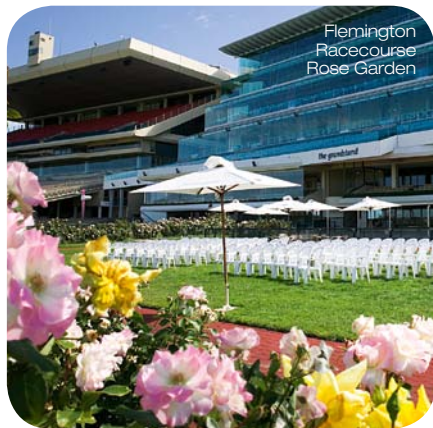
Flemington Racecourse Rose Garden

After many years of research and development by Neutrog in conjunction with the Rose Society of SA and a number of professional rose growers, Sudden Impact for Roses was finally launched in August 2001.